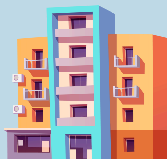
NEW DEVELOPMENTS COMING SOON