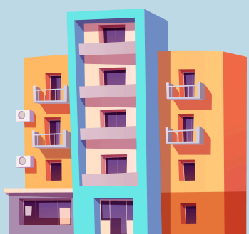
SYCAMORE SENIOR APTS.